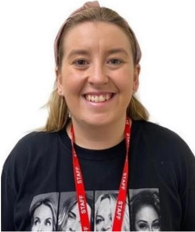
Bumblebee Class Teacher

I have worked with Reception, Year 1, Year 2 and Year 3 but I specialised in Early Years at University and how children learn through play. I enjoy baking, swimming, painting and taking long walks in the countryside or on the beach. I am part of a big family and love spending time with my sister and two brothers, (along with my tortoise Turbo and hamster Cookie). What I enjoy most about working at Langafel is the supportive team and amazing children who smile each day and take each challenge in their stride. The best parts about being a teacher for me are listening to children read and making beautiful art projects together. I hope to see you soon!