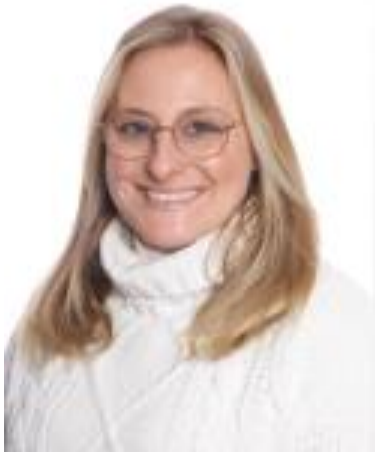
Ladybird Class Teacher & Phase Leader

Dear Ladybirds, I have worked in most classes at Langafel, and this will be my third year in Foundation Stage. I think Reception is your most important year, building the foundations of a love of learning, and making firm friendships that will hopefully last your whole school journey. I can't wait to share with you my summer experiences, and hear all about yours. I have less pets than I used to these days: I have a chihuahua, two cats, a hamster and a snake! I love being outside in the fresh air, or curled up with a book in front of the fire. We are going to have the best year together, looking forward to seeing you all again very soon. Enjoy your summer fun!